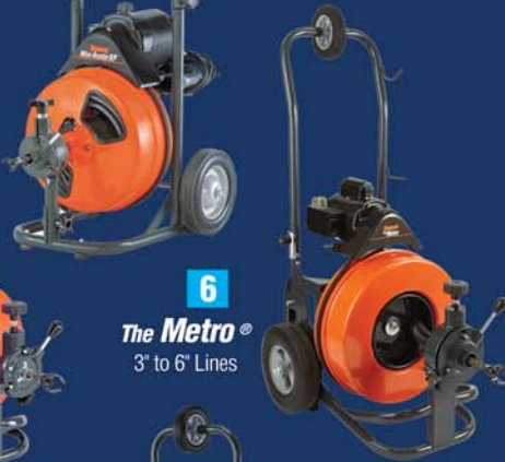
6 The Metro® 3" to 6" Lines