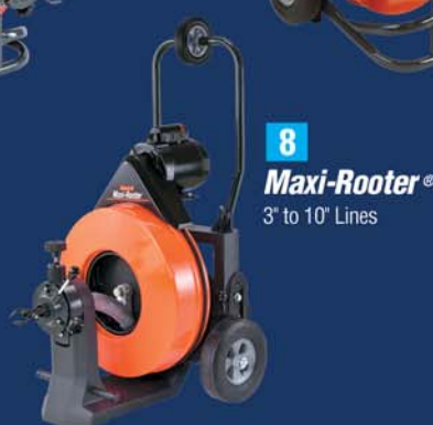
8 Maxi-Rooter® 3" to 10" Lines