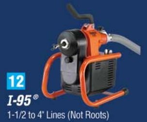
12 I-95® 1-1/2 to 4" Lines (Not Roots)