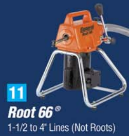
11 Root 66® 1-1/2 to 4" Lines (Not Roots)