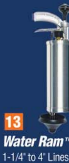
13 Water Ram™ 1-1/4" to 4" Lines