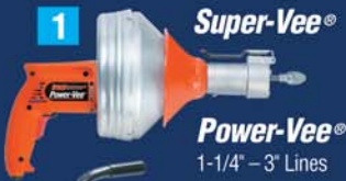
1 Super-Vee® Power-Vee® 1-1/4" - 3" Lines