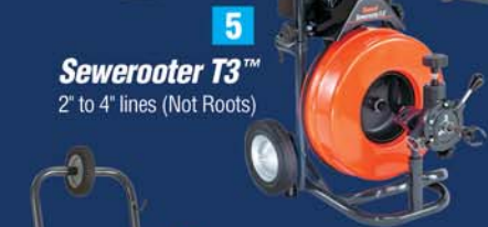
5 Sewerooter T3™ 2" to 4" lines (Not Roots)