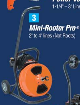
3 Mini-Rooter Pro® 2" to 4" lines (Not Roots)