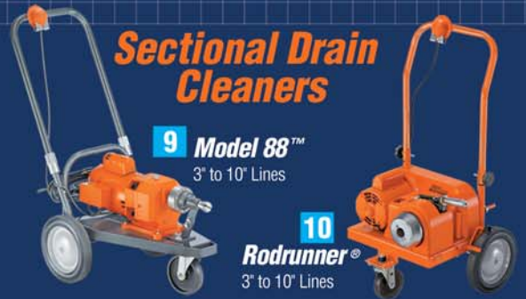
9 Model 88™ 3" to 10" Lines