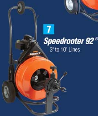
7 Speedrooter 92® 3" to 10" Lines