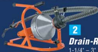
2 Drain-Rooter PH™ 1-1/4" - 3" Lines