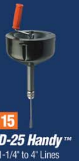
15 D-25 Handy™ 1-1/4" to 4" Lines