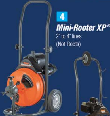
4 Mini-Rooter XP® 2" to 4" lines (Not Roots)